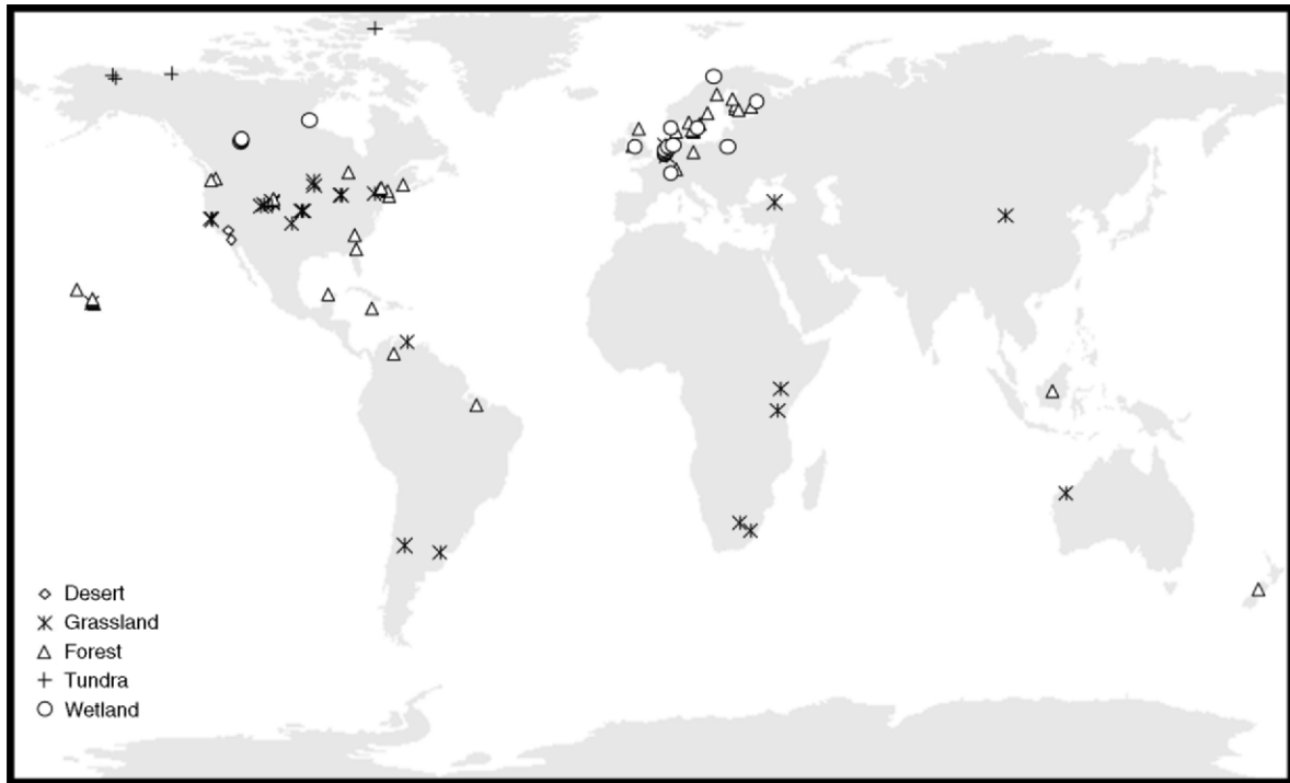
FIG. 1. Global distribution of studies included in the meta-analysis, by biome.

increases in tropical N deposition might not have an important impact on global NPP. Although previous syntheses and reviews support global patterns of nutrient limitation in line with the geophysical hypotheses, no studies have directly tested global patterns of N limitation based on observed plant response to experimental N addition.